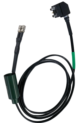
Dual silicone cable with Olympus plug and connector guard