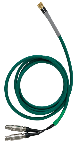
Dual silicone cable with fiberglass sheath and Lemo connectors